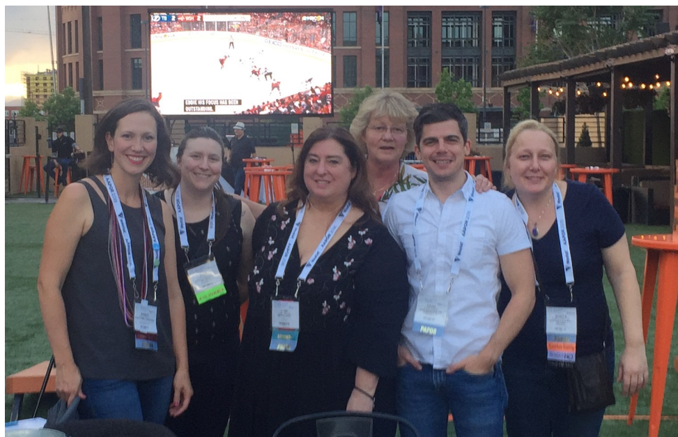
Thursday Night: Off-Site PAPOR Chapter Event-AAPOR 2018

organized off-site event to celebrate the conference being in our region this year. The event was a successful night of comradery, networking, photos in the photo booth, games, prizes, music, and karaoke.